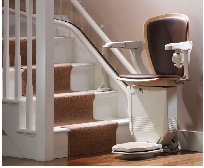
Designed to blend into your home, the Stannah 260 with Starla chair comes in many upholstery choices and is custom-made to hug your stairs.

Choose from five upholstery colors, which are also available trimmed with light- or dark wood. We'll design your stairlift to make the best use of the space available, and custom-make the rail to hug the side of your stairs. Installation typically takes less than half-a-day, after which you'll be able to enjoy the full use of your home in comfort and safety.