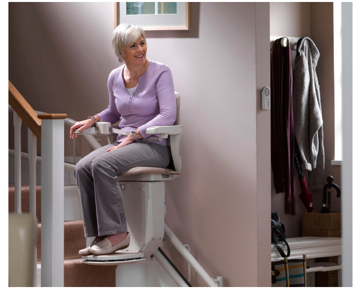
With sensible safety features , the Starla chair is a practical way to enhance your peace-of-mind.