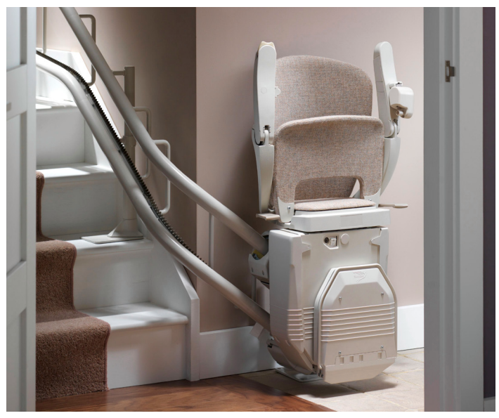
Tight turns and narrow stairs are no problem, and the Stannah 260 can be parked neatly out of the way.